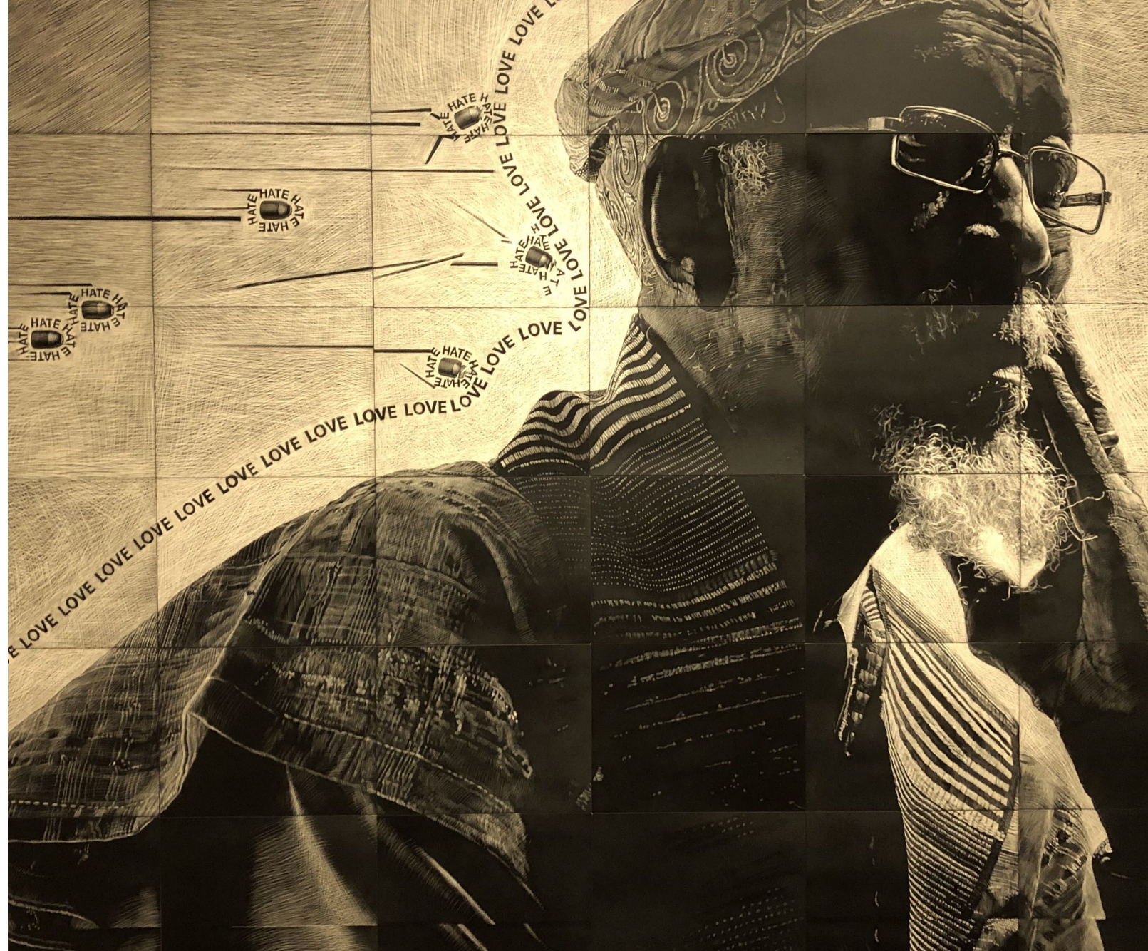
Pate, J. (2024). Love Force [Scratchboard].