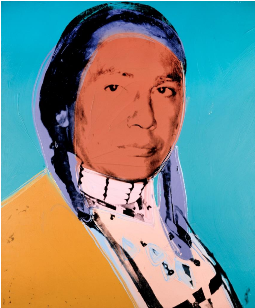
Andy Warhol (American, 1928–1987), Russell Means , 1976, acrylic and screenprint on canvas. Museum purchase with funds provided by the Kettering Fund. 1987.153