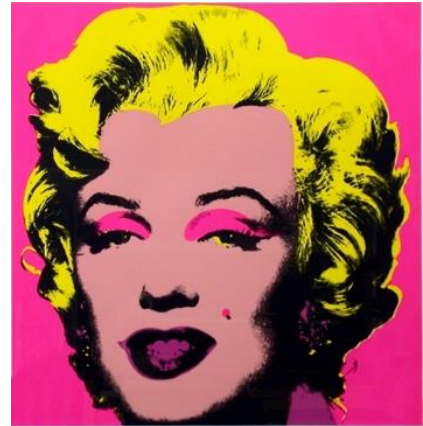
Andy Warhol (American, 1928–1987), Marilyn , 1967, screenprint in colors on paper. Museum purchase, 1968.60.5